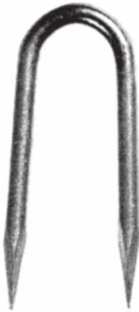
Rolled (Diamond) Point