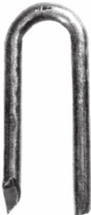
Cut (Slash) Point