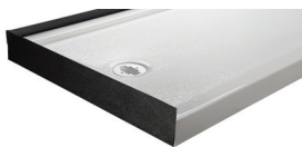
Factory-installed tile flange is 1/16" thick. Account for this thickness when planning final opening size.