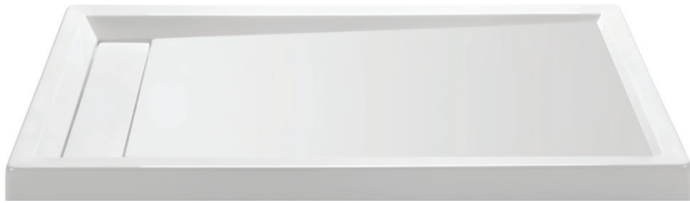
Color matched SculptureStone® hidden drain cover comes standard on white base.