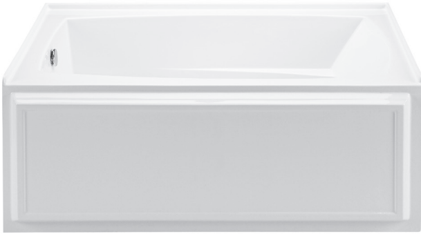
Wyndham 5 features integral skirting, tile flange and armrests.