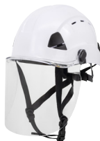
Face shield shown attached to DPG22 Safety Helmet. Helmet sold separately.