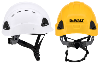
CLASS C VENTED

Adjustable 4-point leather chin strap secures helmet to head and provides comfortable fit.