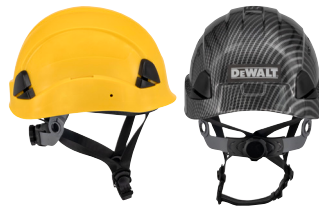
CLASS E NON-VENTED