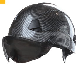
Visor shown attached to DPG22 Safety Helmet. Helmet sold separately.