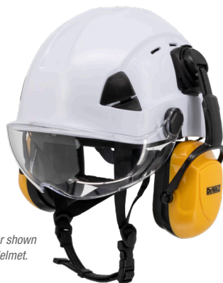
Capmount Earmuff and Visor shown attached to DPG22 Safety Helmet. Helmet sold separately.