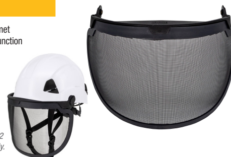
Face shield shown attached to DPG22 Safety Helmet. Helmet sold separately.