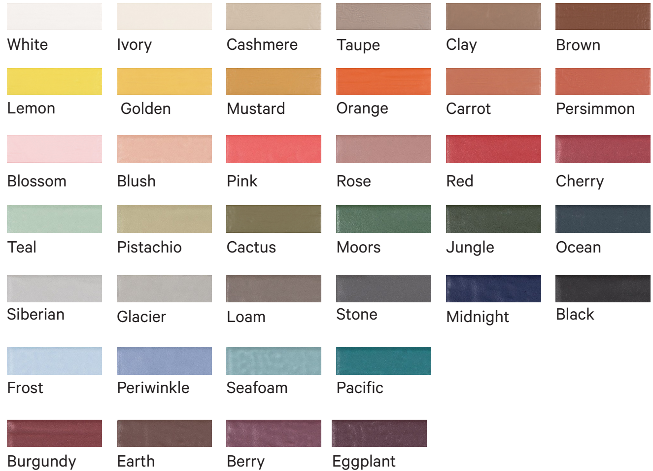
VITL | Willemstad Black & White, 3" x 9"