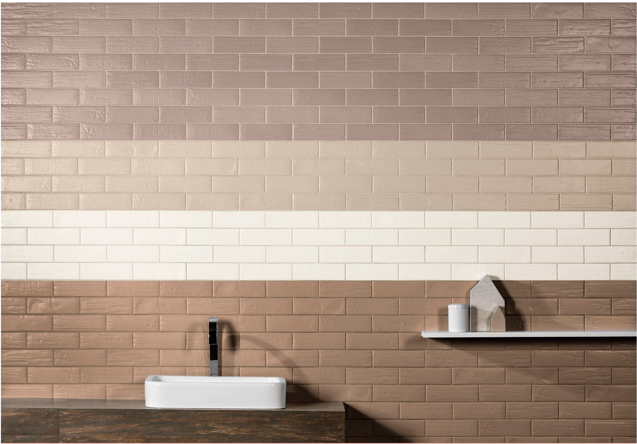
VITL | Willemstad Taupe, Cashmere, Ivory, and Clay, 3" x 9" Matte