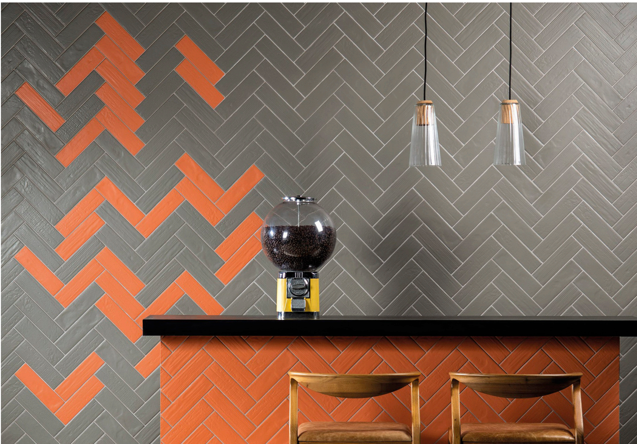
VITL | Willemstad, Orange and Loam, 3" x 9"