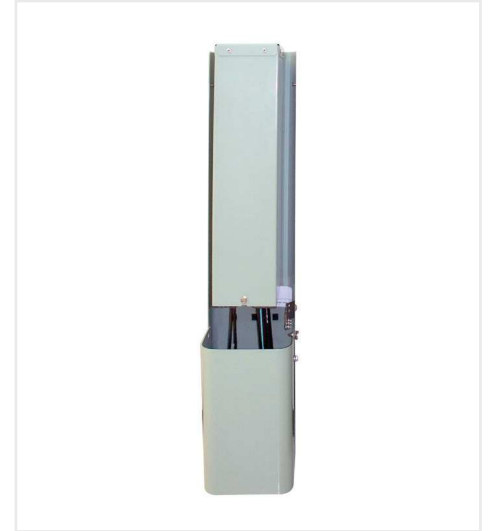
Kit Shown Installed with Cover On (UPCBD4 pedestal sold separately)

Designed for use in most FTTH applications, the NetSpan BDE Series Fiber Distribution Kit converts any standard UPCBD pedestal into a closed architecture, environmentally protected fiber distribution pedestal.