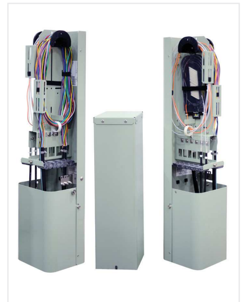
Feeder and Drop Sides Shown Installed with Cover Off (UPCBD5 pedestal sold separately)