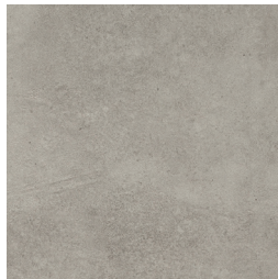
Light Gray VTL PLLG