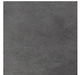
Taupe VTL PLTP