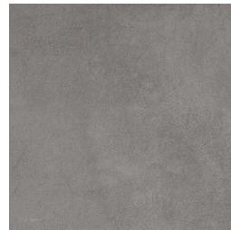
Griege VTL PLGG