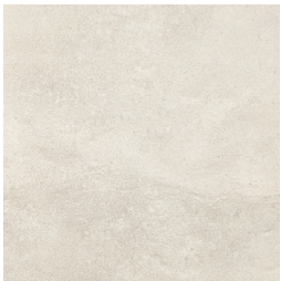
White VTL PLWH