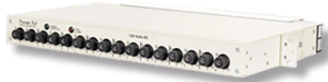
180108-N-0808 / 180108-N48-0808