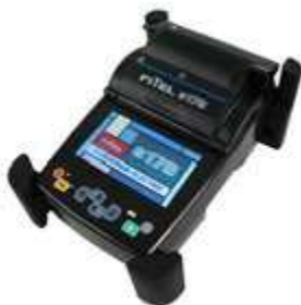
S179A Fusion Splicer