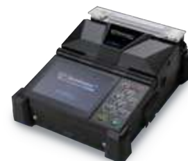
EZ-Terminator Termination Tool