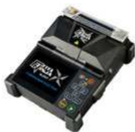
Ninja NJ001 Fusion Splicer

EZ!Fuse Splice On Connector is compatible with the FITEL Fusion Splicers models Ninja, S179, S178 and the EZ-Terminator™.