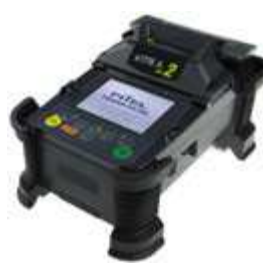
S178A / S153A / S123C Fusion Splicer