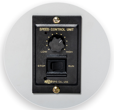
Control the speed of the conveyor belt with the turn of a dial.