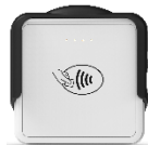
*Aurus R1 TAP payment