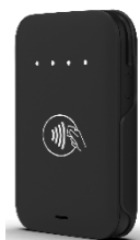
*Adyen NYC1 Contactless payment

Engineered for preferred *payment process devices, ensuring seamless integration and effortless transactions with iPhone.