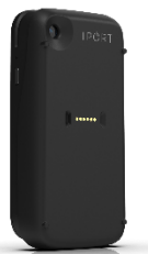
I PORT PayCase for Adyen AMS1 (SKU 72424)