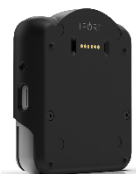
I PORT PayCase for Aurus R1 (SKU 72454)