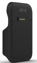
I PORT PayCase for Adyen NYC1 (SKU 72343)