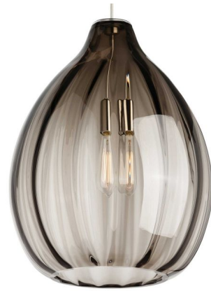
Shown in satin nickel / smoke

Harper Pendant is a large scale glass pendant featuring a classic bulb shape with organic texture handcrafted by highly skilled Polish artisans. Glass shade is available in three colors with three finish options. Includes a 4.5in canopy. Note: Not all options are available.