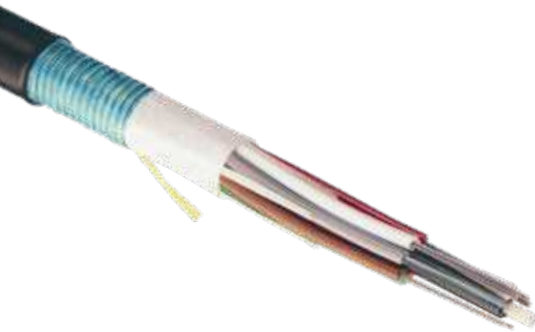
Fortex™ DT Light Armor Loose Tube Fiber Optic Cable

Lose the Gel with Durable, Totally Gel-Free Fiber Optic Cable for Cleaner, Faster Installations