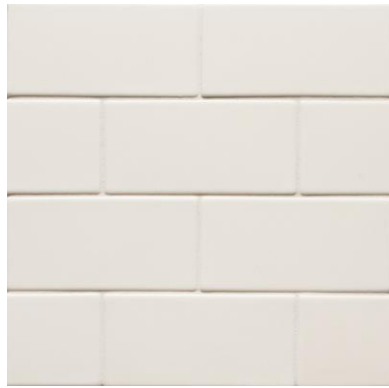
Canvas Gloss Also available in a Matte finish