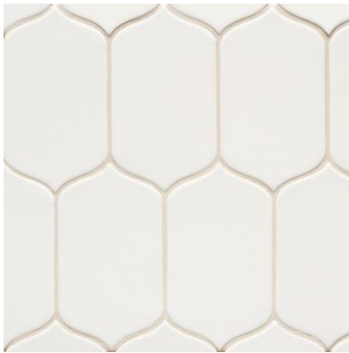
Cocoon Mosaic 3 1/4" x 6"