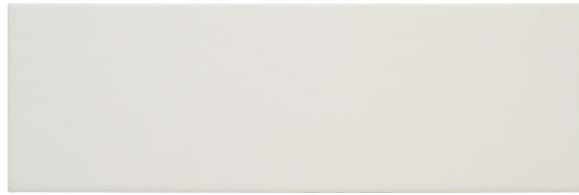
Field 4" x 12"