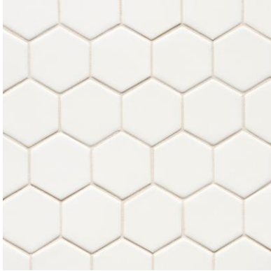
Hexagon Mosaic 2" x 2"