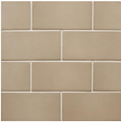
Flax Gloss Also available in a Matte finish