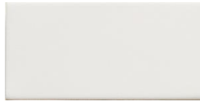
Field 3" x 6"

Clean, crisp and classic, 6th Avenue is a ceramic tile collection created to offer Classic Walker Zanger Style at an excellent value. Featuring a wide selection of field tile shapes and moldings, 6th Avenue also boasts a sophisticated range of mosaic fields, from floor ready hexagons to modern, organic inspired shapes. These shapes are complemented by a versatile color palette of 12 stock whites and tinted neutrals. Whether your desires run to the classic "Subway Tile" backsplash or perhaps something more adventurous, 6th Avenue is the new address for the best tile style in town.