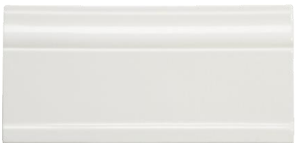
Base Molding 4" x 8 1/2"