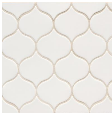
Julia Mosaic 3" x 3 1/2"

Some styles are not stocked in all colors. Please see walkerzanger.com for details.