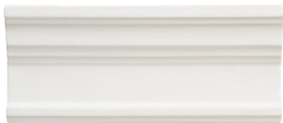
Cornice Molding 3 5/8" x 8 1/2"