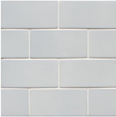
Pale Sky Gloss