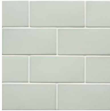
French Clay Gloss