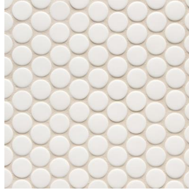
Round Mosaic 1" x 1"