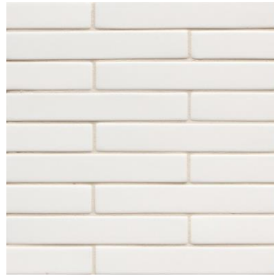
Mosaic 1" x 6"