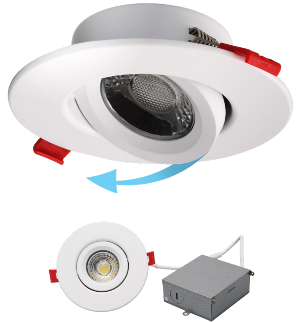
DGC4 9W LED Recessed Gimbal