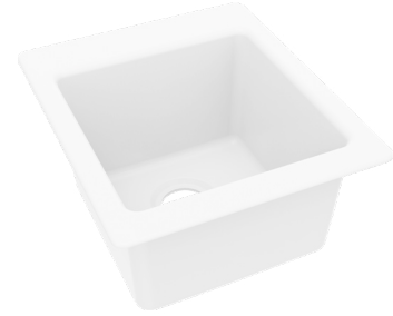
SSUS-S SMALL SWANSTONE® UTILITY SINK