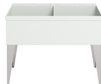
MF-2 DOUBLE LAUNDRY TUB

18 gallon capacity Available with legs or wall-mounting brackets