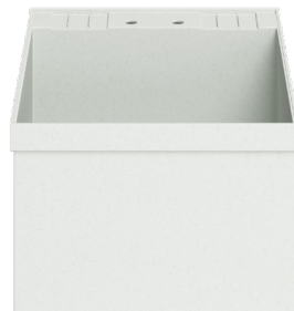
MF SINGLE LAUNDRY TUB

18 gallon capacity Available with legs or wall-mounting brackets