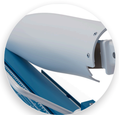
Rotating protective guard keeps fingers safe and prevents injury.