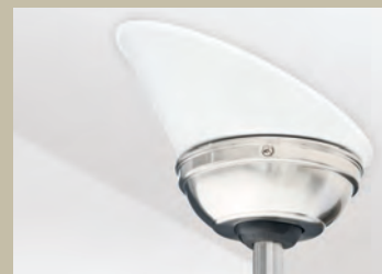
Sloped Ceiling Adapter (SCA)

The Casablanca Sloped Ceiling Adapter provides an easy way to hang your Casablanca ceiling fan from an angled ceiling. Designed for ceilings at an angle between 32 degrees and 56 degrees, the Sloped Ceiling Adapter works with the hanging system that comes with your ceiling fan to ensure the safe operation that you expect from Casablanca.