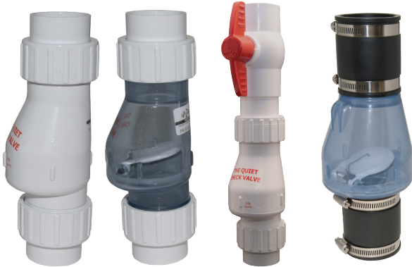
P/N 30-0040 White PVC