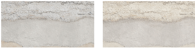
Raw Earth Cool