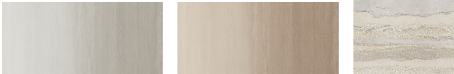
Underglazed Ombre Cool