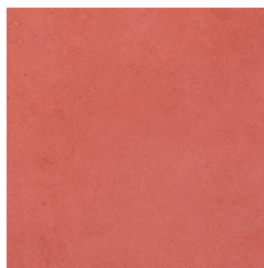
A1412 ▶ Chicago Fire