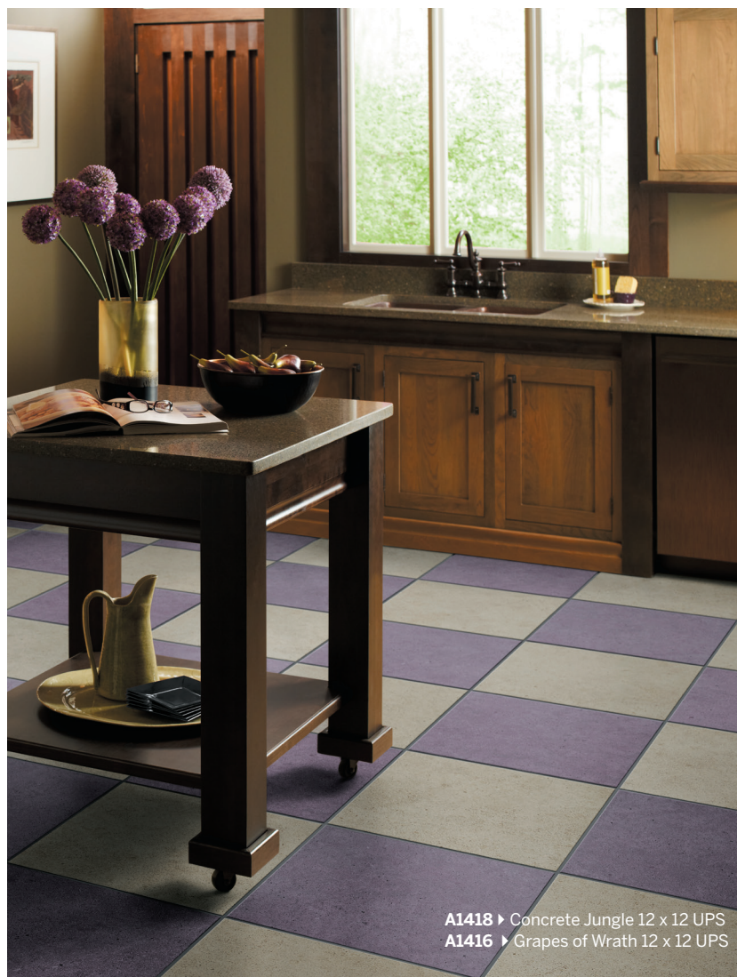
A1418 ▶ Concrete Jungle 12 x 12 UPS A1416 ▶ Grapes of Wrath 12 x 12 UPS