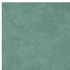
A1407 ▶ Water Vapors