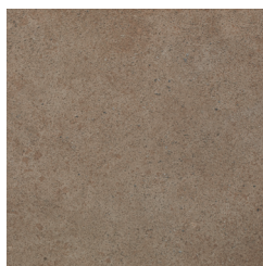
A1419 ▶ Muddy Waters