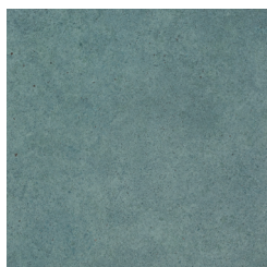
A1408 ▶ Glacier Lake