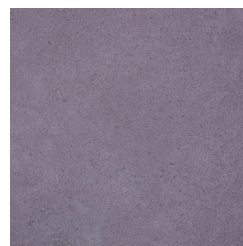
A1416 ▶ Grapes of Wrath