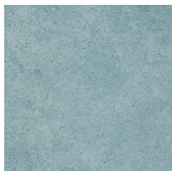
A1413 ▶ Under the Sea