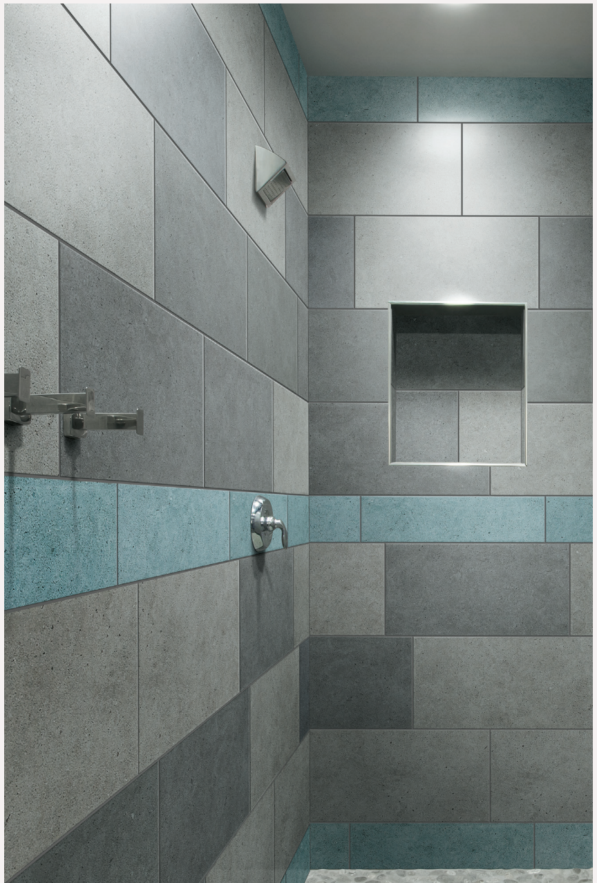
A1420 ▶ On the Rocks 12 x 24 UPS A1417 ▶ Clean Slate 12 x 24 UPS A1413 ▶ Under the Sea 6 x 24 UPS