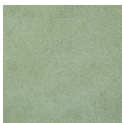
A1405 ▶ Hollywood and Vine