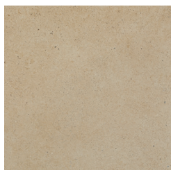
A1404 ▶ Cowboy Up