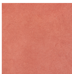
A1411 ▶ Sunset Boulevard