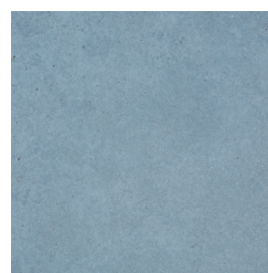
A1414 ▶ Carnegie Cool