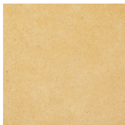
A1409 ▶ Lemon Drop