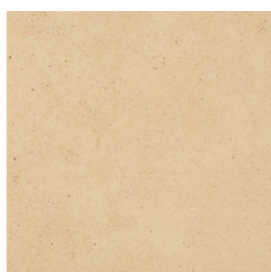
A1402 ▶ Sacred Sand