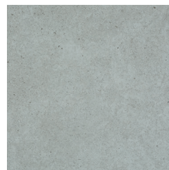
A1417 ▶ Clean Slate