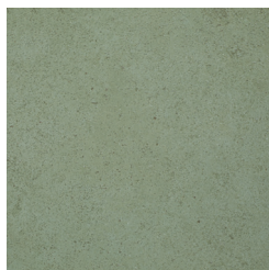
A1406 ▶ Emerald City