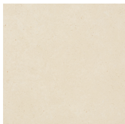
A1401 ▶ Winter Garden