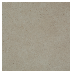
A1418 ▶ Concrete Jungle