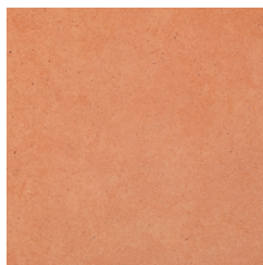
A1410 ▶ Orange Crush