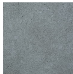
A1420 ▶ On the Rocks

A1409 ▶ Lemon Drop 6 x 24 UPS and A1401 ▶ Winter Garden 12 x 24 UPS shown on cover