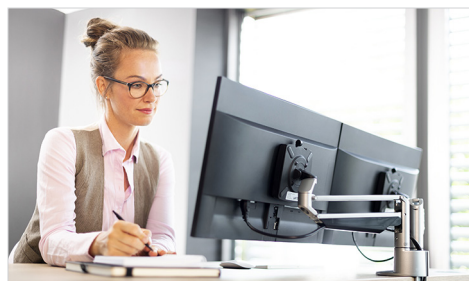
Easy Alignment: Gas spring movement and flexible joints for perfect monitor alignment.