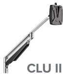
CLU II (no mount)