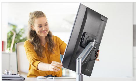
Smooth Rotation: Monitor rotation for landscape or portrait viewing.

Aluminum construction with gas spring adjustability provides effortless vertical movement. These monitor arms are German engineered and held to the highest standards for quality and durability.