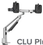
CLU Plus X2