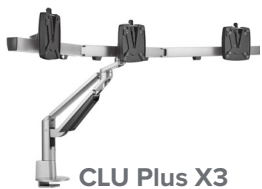
CLU Plus X3