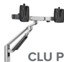
CLU Plus X2 (no mount)