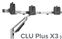
CLU Plus X3 (no mount)