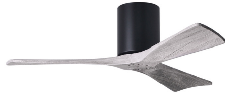
Shown in matte black / barn wood tone

The Atlas Irene Hugger Ceiling Fan is rustic yet strikingly modern, with cleanly joined solid wood blades and a minimal cylindrical motor housing. Its streamlined profile with the warm, natural look of wood works beautifully in contemporary and transitional spaces. Equipped with a DC motor, the fan is energy efficient and ultra-quiet. A hand-held remote control and wall control are included, both able to turn the motor on/off and set 6 speeds and forward/reverse. For fans that have a light, the controls also turn the light on/off and dims it. Fans that have a light include a cap matching the housing finish for no-light use. Note: Some combinations of motor finish, blade color, and light option are not available. The 72 inch is available in a 3-blade only and is not available with a light option.