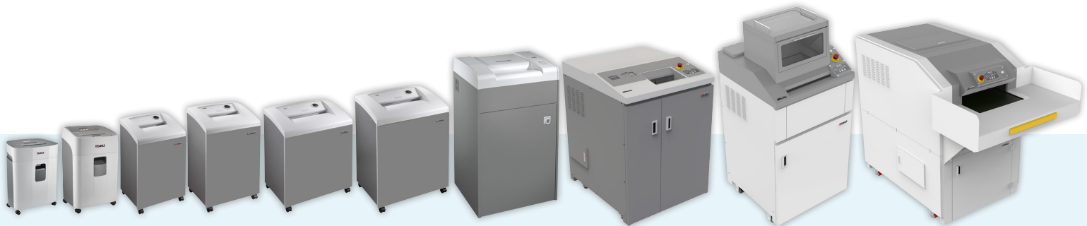
Auto-Feed — Deskside — Small Office — Office — Department — High Capacity — High Security — Digital Media