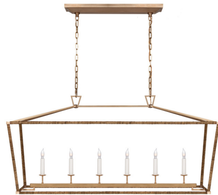
Shown in antique burnished brass / natural rattan