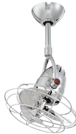
Shown in polished chrome

The Atlas Fan Diane Metal Ceiling Fan is an oscillating directional fan that provides maximum, multi-directional airflow. Designed to be hung in small, awkward spaces or in front of HVAC ducts to make more efficient the heating, ventilation, or air conditioning of any room. AC motor construction of cast aluminum and heavy stamped steel in Polished Chrome, Matte Black Brushed Nickel or Textured Bronze finish with a decorative cage covering the metal blades for safety. Features a 13 inch blade span and 31 degree pitch. 90 degree forward and reverse sweeping oscillating function. Includes a vaulted ceiling canopy for up to 29 degrees, 10 inch downrod, and a 3-speed RF remote control in Black. ETL listed. Suitable for damp locations. Limited lifetime warranty.