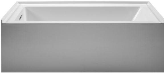
Features integral skirting and tile flange.