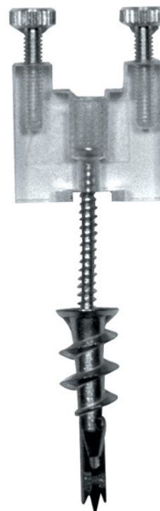
Wall MonoRail Standoff

Order one for every three feet of run and at corners.