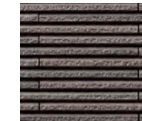
HAL-20BN/HB-6 Dark Brown★