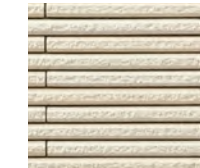
HAL-20BN/HB-1 Light Beige★

The textured design of the Hosowari Border tile draws on traditional Japanese architecture and ancient tile walls constructed from reused or broken roof tiles layered with clay.