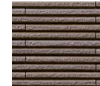
HAL-20BN/HB-7 Light Dark Brown