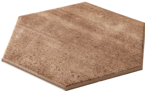
Detail of the Marron Flat Hex Surface