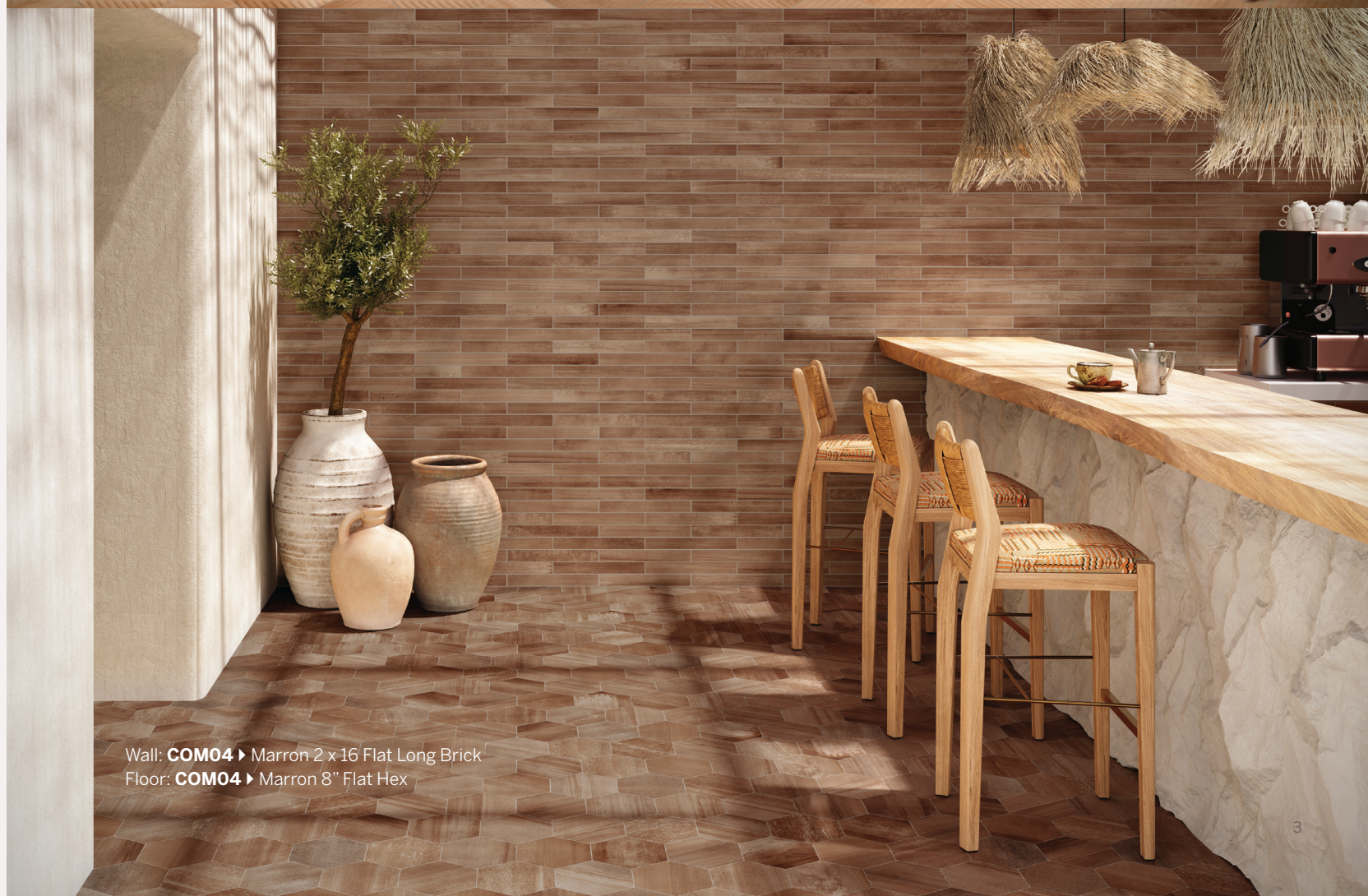
Wall: COM04 ▶ Marron 2 x 16 Flat Long Brick Floor: COM04 ▶ Marron 8" Flat Hex