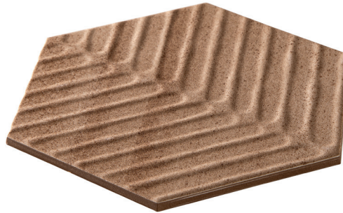
Detail of the Marron Chevron Hex Surface