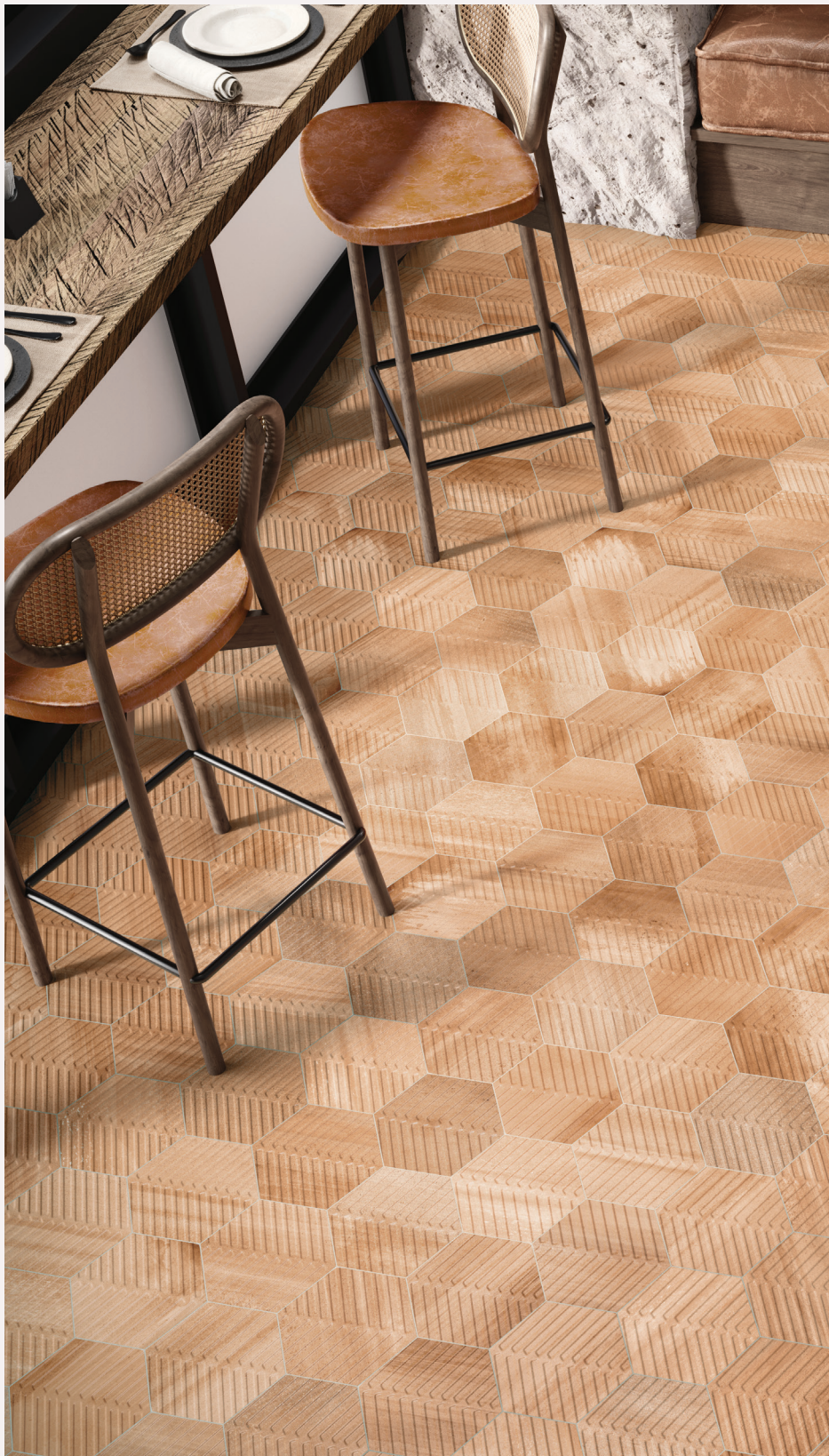
COM03 ▶ Naranja 8" Chevron Hex

Available in four clay and terracotta tones, Cotto Moderno is anything but traditional. The bohemian style and artisanal make up of each unique tile bring nature's energy to your vision.