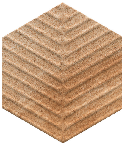
COM03 ▶ Naranja 8" Chevron Hex