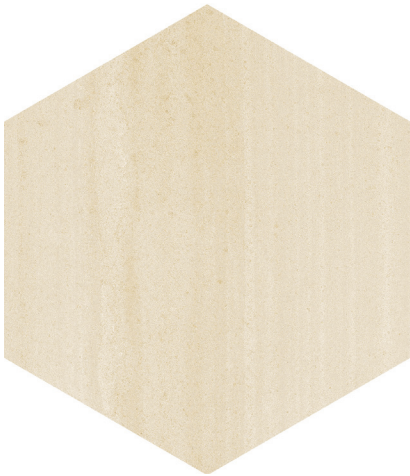
COM01 ▶ Blanco 8" Flat Hex