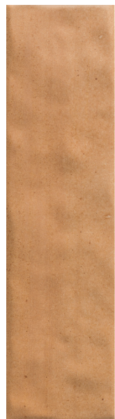
COM03 ▶ Naranja 3 x 10 Undulating Wall Brick*