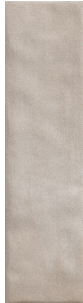
COM02 ▶ Taupe 3 x 10 Undulating Wall Brick*