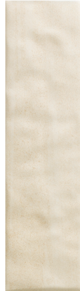
COM01 ▶ Blanco 3 x 10 Undulating Wall Brick*