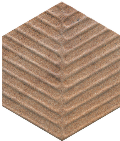
COM04 ▶ Marron 8" Chevron Hex