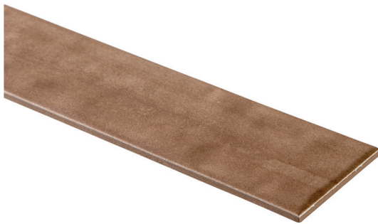
Detail of the Marron 3 x 10 Undulating Wall Tile Surface