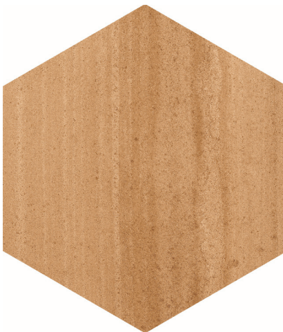
COM03 ▶ Naranja 8" Flat Hex