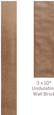
3 x 10* Undulating Wall Brick