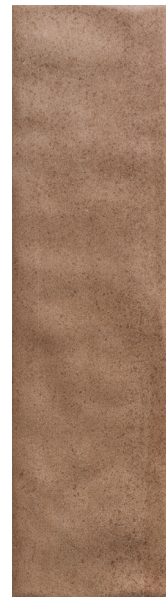
COM04 ▶ Marron 3 x 10 Undulating Wall Brick*