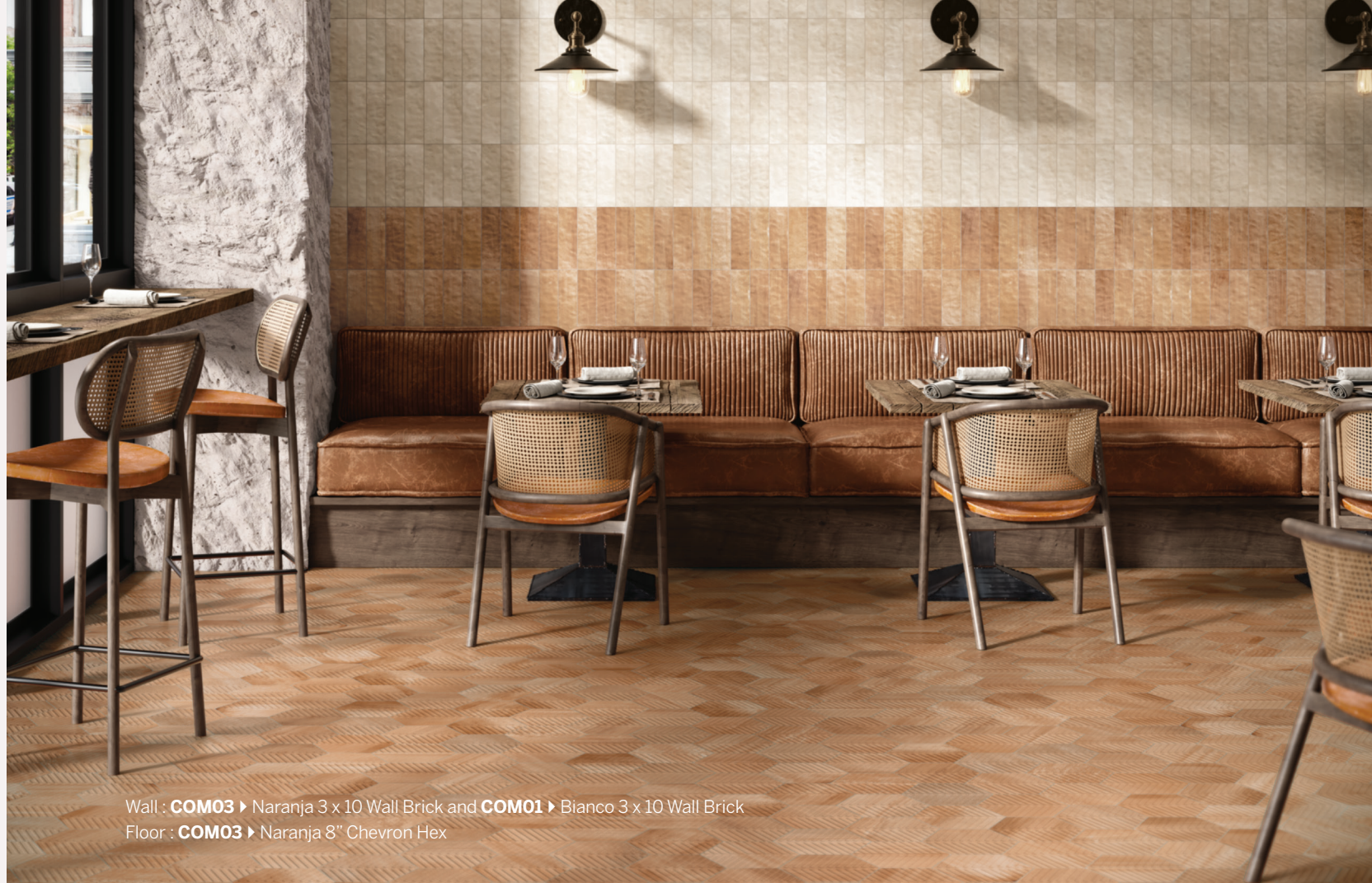
Wall : COM03 ▶ Naranja 3 x 10 Wall Brick and COM01 ▶ Bianco 3 x 10 Wall Brick Floor : COM03 ▶ Naranja 8" Chevron Hex