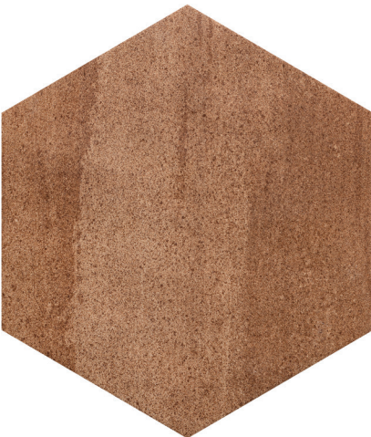
COM04 ▶ Marron 8" Flat Hex