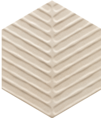
COM01 ▶ Blanco 8" Chevron Hex