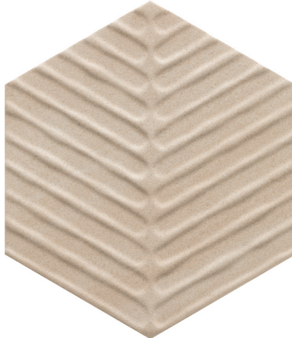
COM02 ▶ Taupe 8" Chevron Hex