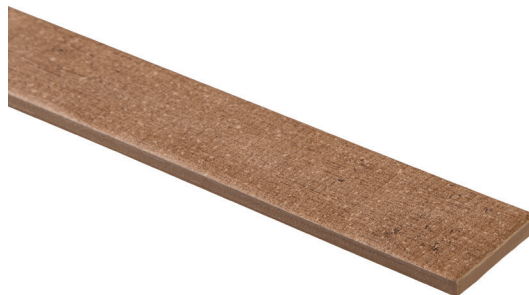
Detail of the Marron 2 x 16 Long Brick Surface