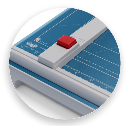
The adjustable alignment guide ensures accuracy during repetitive cuts.