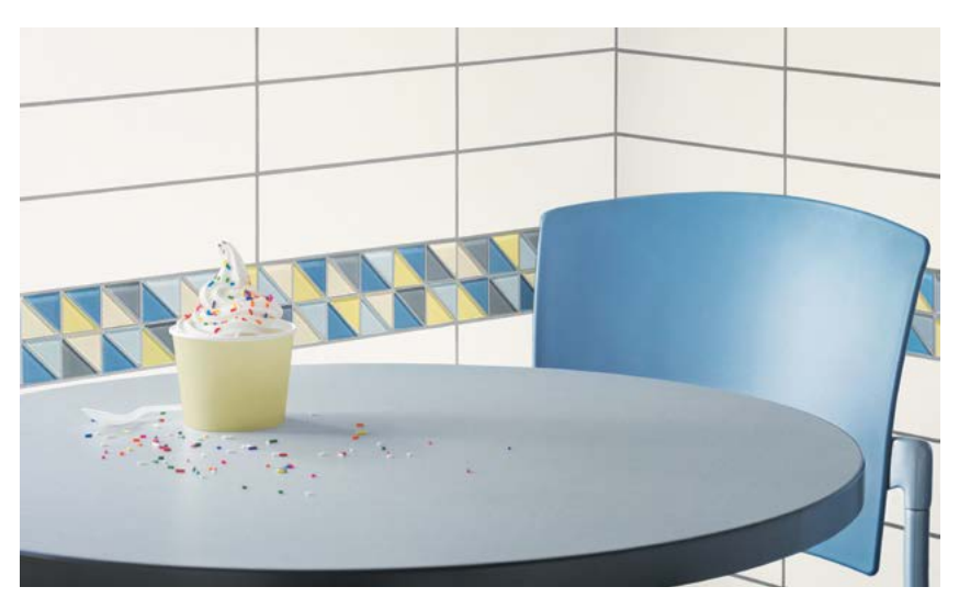
GGB02 ► Jitterbug 2 x 2 Blends Color By Numbers WT02 ► Tea For Two 4 x 12