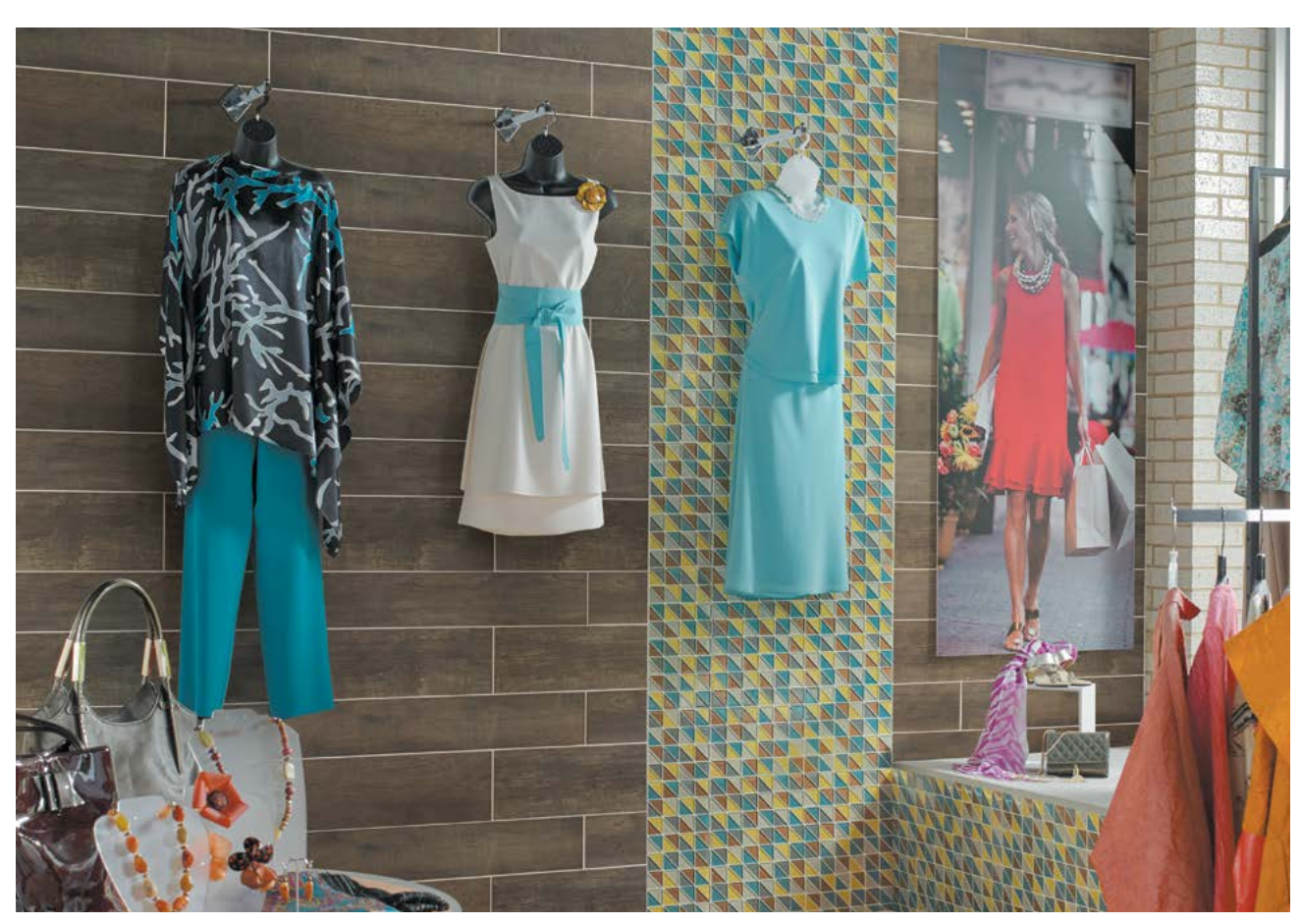
GGB01 ➤ Swing 2 x 2 Blends SpeakEasy AV285 ➤ Bank Roll 6 x 36 and 8 x 36

Information listed here is subject to change. Please refer to CrossvilleInc.com for the latest, most accurate information.