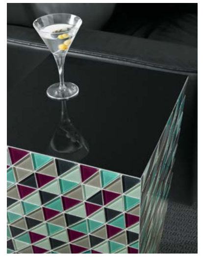
GGB04 ▶ Jive 2 x 2 Blends