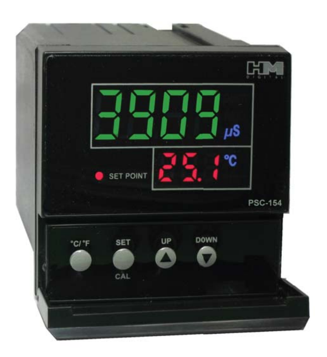
PSC-154 EXTENDED RANGE TDS/EC CONTROLLER WITH 4-20mA OUTPUT