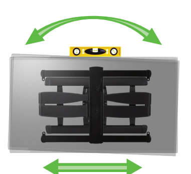
Post installation adjustments