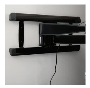
FollowThru™ in-arm cable channel