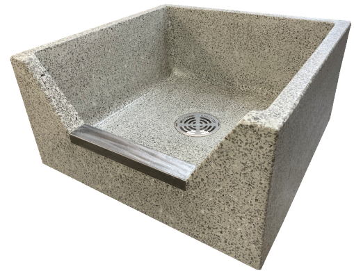
(Shown above) HL-1800

Stainless steel caps on all horizontal shoulders and tiling flange may be added to customize any sink to meet your specifications.