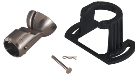
A245-BN ( \frac{3}{4} " I.D.) | Slope Ceiling Adapter Kit (SCA) U.S. Patent(s): 7,510,160