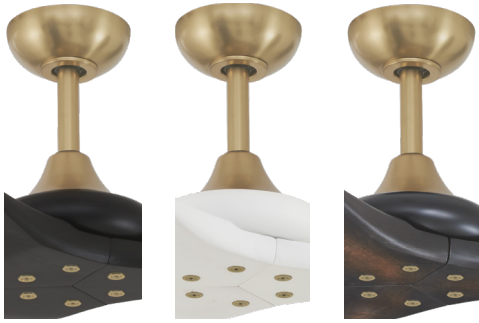
A662-SBR | Soft Brass Conversion Kit Available for F662 fans (See Pages 32 & 33)