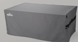
OPTIONAL UV PROTECTED FITTED COVER