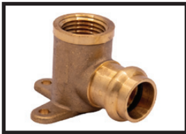
Press x Female IPS Drop Ear 90° Elbow