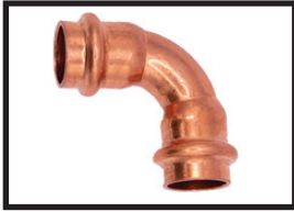
Press x Press 90° Elbow