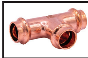
Press x Press x Press Tee