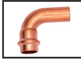
Press x Fitting 90° Elbow