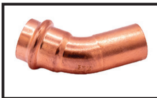
Press x Fitting 45° Elbow