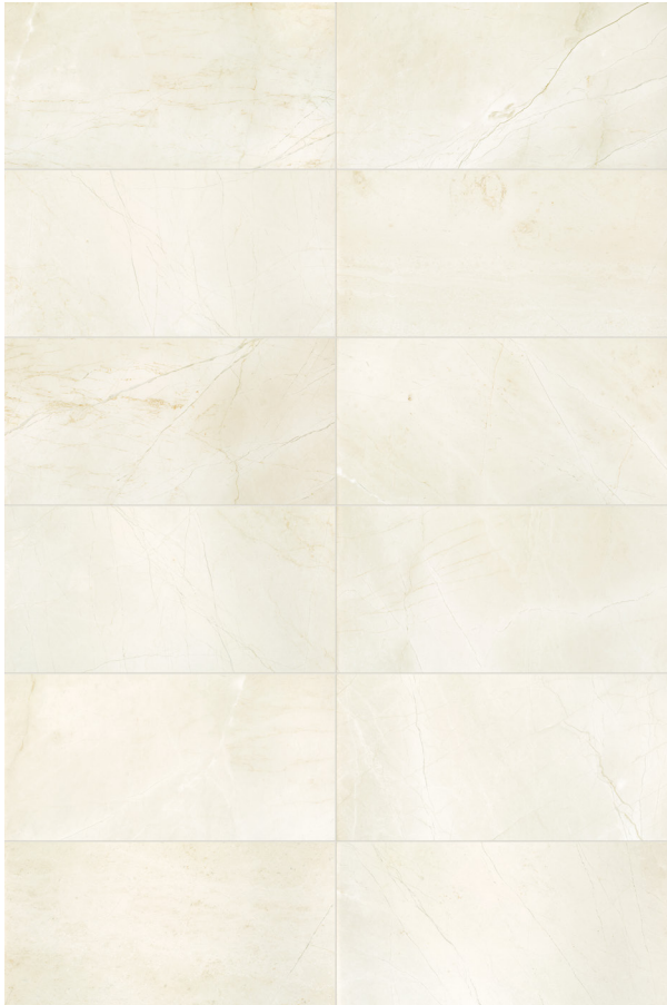
Viola Roccia VTS AVCR 1836H VTS AVCR 2424H VTS AVCR 1224H VTS AVCR 312H