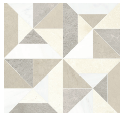
15" x 15" Tria Dune Mosaic Honed VTS WJDN TRIAM