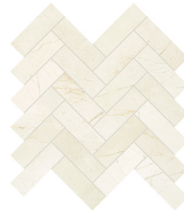
1" x 4" Herringbone Mosaic VTS AVCR HERRINGH