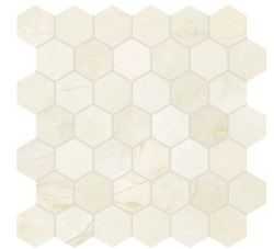
2" Hex Mosaic VTS AVCR HEX2H