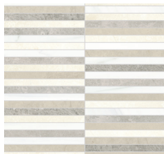
12" x 12" Stacked Dune Mosaic Mixed VTS WJDN MOS16M