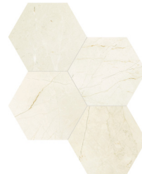
6" Hex Mosaic VTS AVCR HEX6H