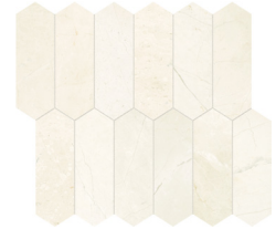
2" x 6" Picket Mosaic VTS AVCR PICK26H