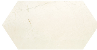
24" Picket VTS AVCR PICK24H