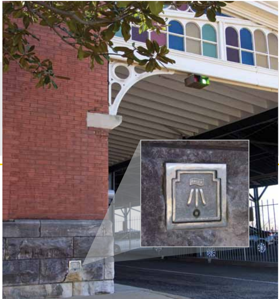
FIG. # 5560QT 5560QT (SAP-H-WH)