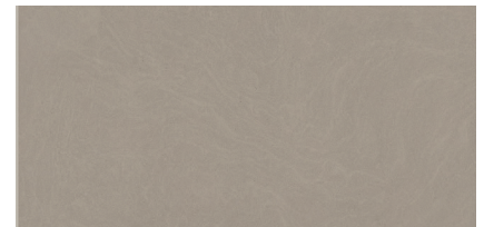
Greige VTL RIGG