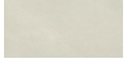
White VTL RIWH