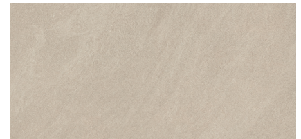
Beige VTL RIBE