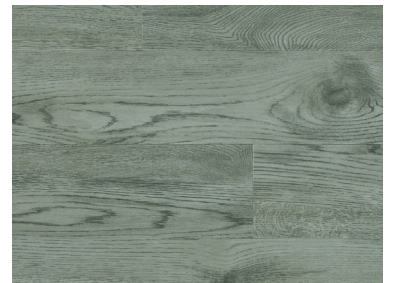
Light Gray Oak