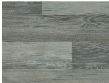
Medium Gray Oak