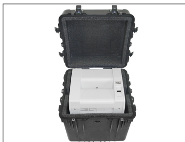
This shredder comes equipped with a high impact plastic mobility case for easy transit.