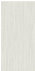
White VTL WOWH