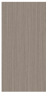
Brown VTL WOBR