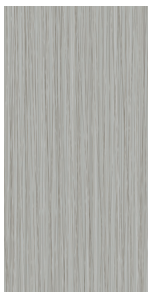
Gray VTL WOGR