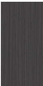
Black VTL WOBL