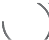
LC-SK5 – Shim Kit for 5" Round Tops LC-SK6 – Shim Kit for 6" Round Tops