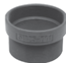
LC-U – Cast Iron Extension