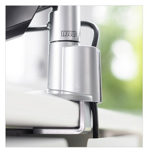
Fast installation on any work surface gets you up and running quickly.