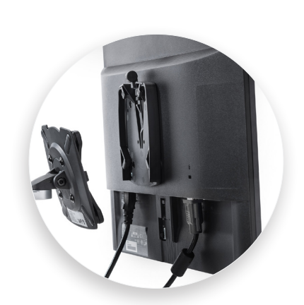
QuickRelease connection makes it easy to relocate or upgrade monitors.