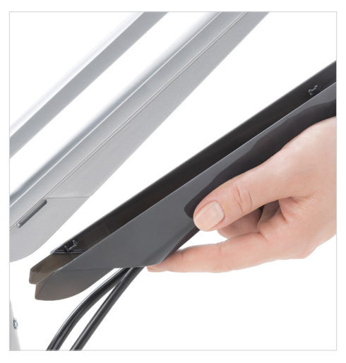
Space-saving design allows you to neatly hide cables to maximize your workspace.