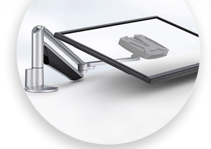
Flexible positioning for low screen viewing.