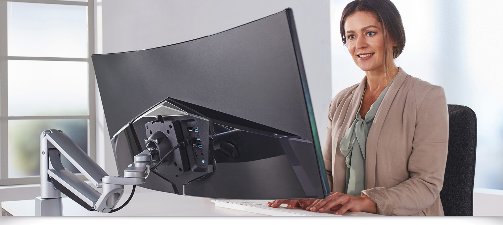
The Novus CLU Plus is designed with a heavy-duty gas spring for easily adjusting large, widescreen monitors.