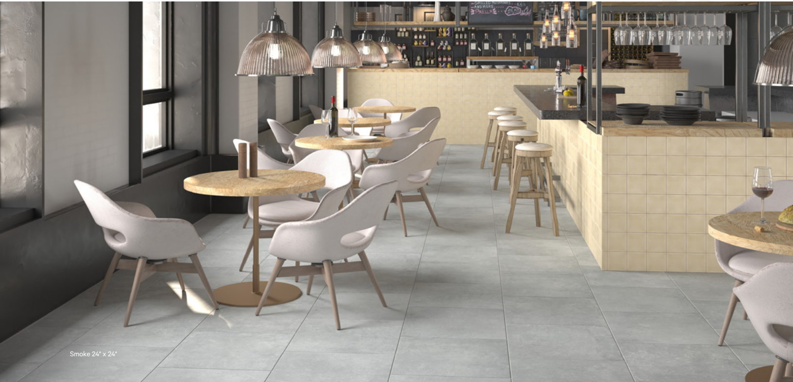
Smoke 24" x 24"

STANLEY COMBINES THE AESTHETICS OF RECLAIMED STONE AND DISTRESSED CONCRETE.