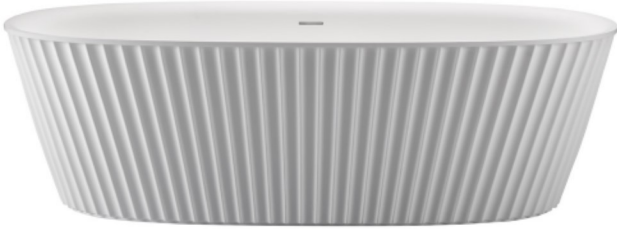
Features an integrated overflow.