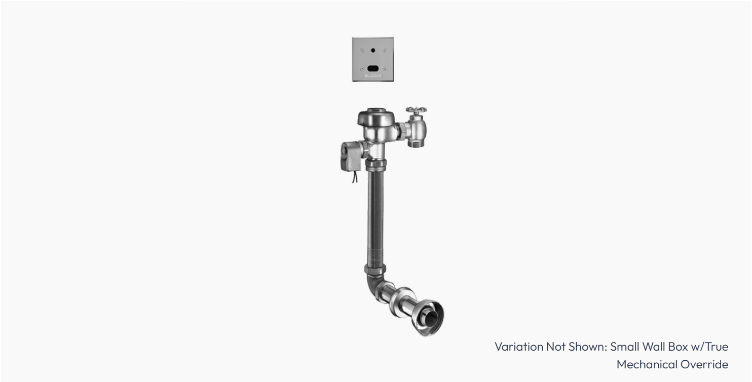
Variation Not Shown: Small Wall Box w/True Mechanical Override