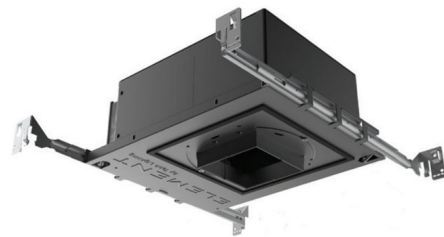
Shown in black powder coat